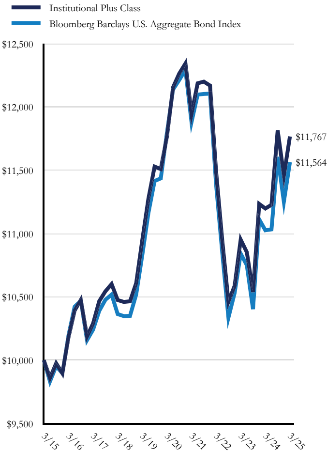
Total Return Based on a $10,000 Investment

The above chart represents historical performance of a hypothetical $10,000 investment over the past 10 years.